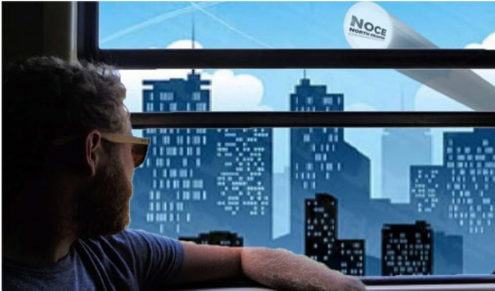
Photo design by student James Huynhngo from the NOCE Photoshop Class.