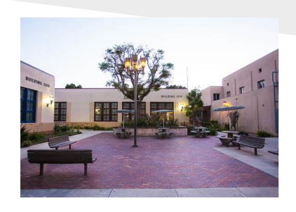
Wilshire Center *next to Fullerton College