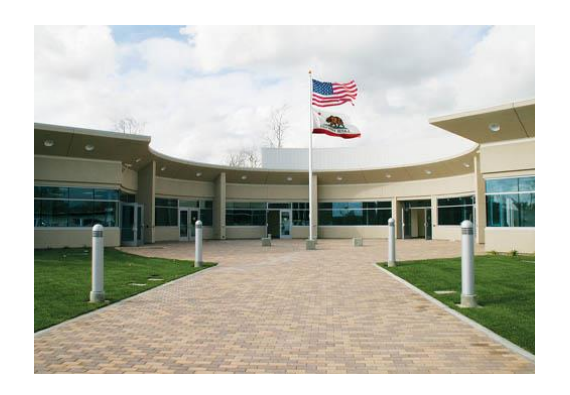
Cypress Center *located on Cypress College's Campus