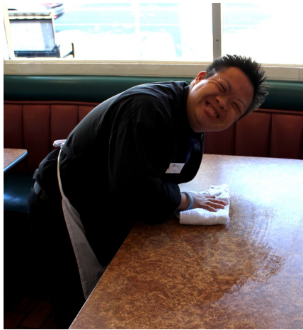
W.I.S.E. Job Skills Class