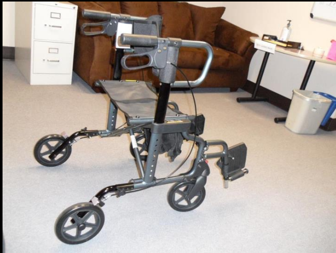
Rollator Transport Chair