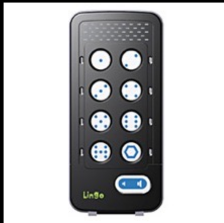
Wearable Messaging and Communication Aid