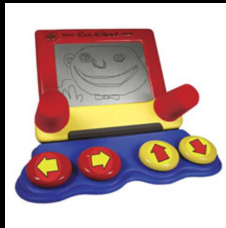
Etch-A-Sketch Switch Adapted