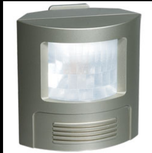
Door Knock Sensor