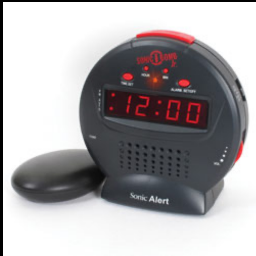
Super Shaker: Vibrating Alarm Clock