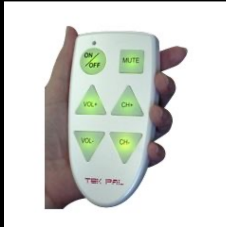
Large Button TV Remote Control