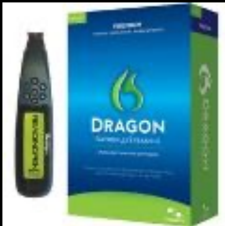
Reading Pen and Dragon Naturally Speaking Bundle