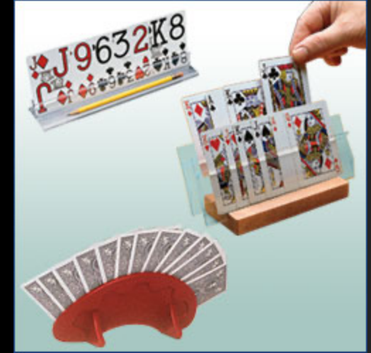
Playing Card Holders