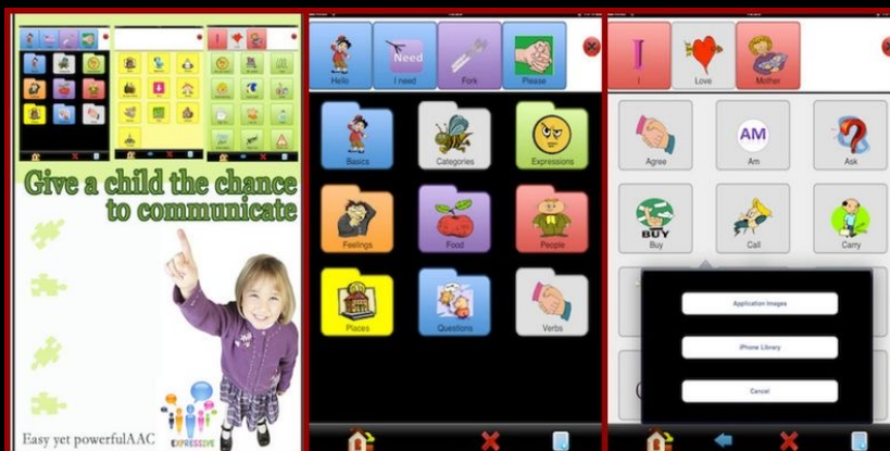
Communication iPad Apps for Kids