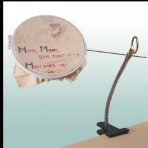
Crocheting and Embroidering Aids