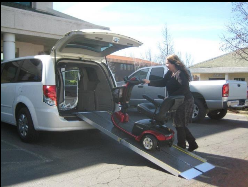
Modified van with ramp