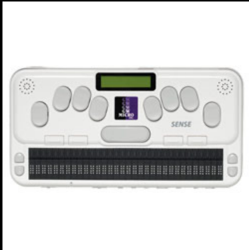
Braille Sense Plus Notetaker and MP3 Player