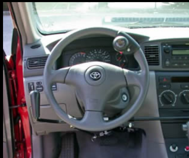
Steering Spinner Knob