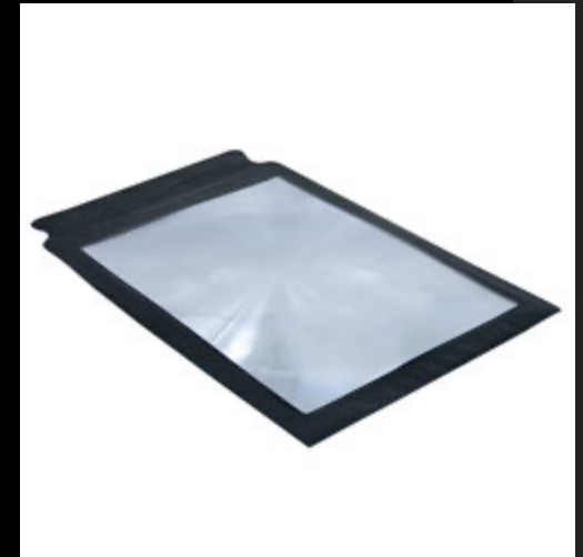
Full Page Magnifier