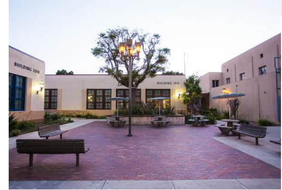
Wilshire Center *next to Fullerton College