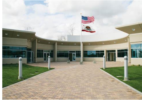
Cypress Center *located on Cypress College's Campus